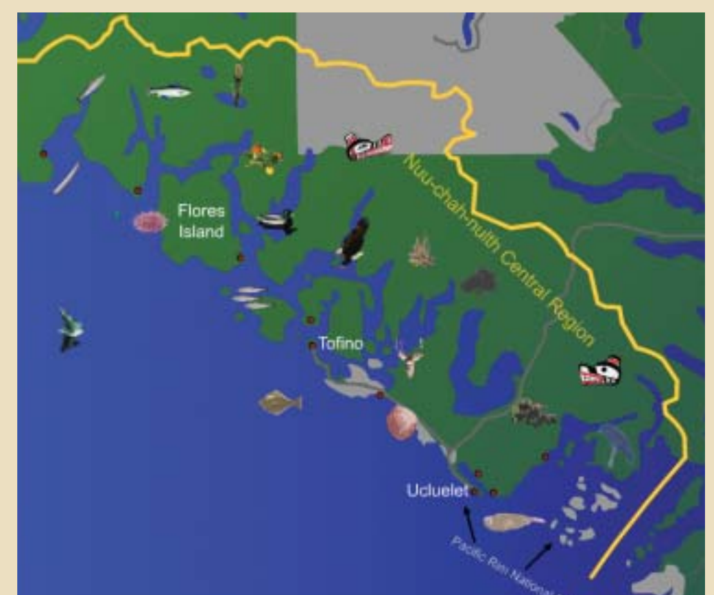
SCREEN IMAGE FROM FIRST NUU-CHAH-NULTH LANGUAGE CD-ROM

The work of the Clayoquot Alliance in support of the Language Group has centred on the production of a multimedia CD-ROM documenting the Nuu-chah-nulth names and cultural knowledge of selected native plants, animals and marine resources. This is the first of a planned series of CD-ROMs highlighting the traditional language and culture of the Central Region First Nations.